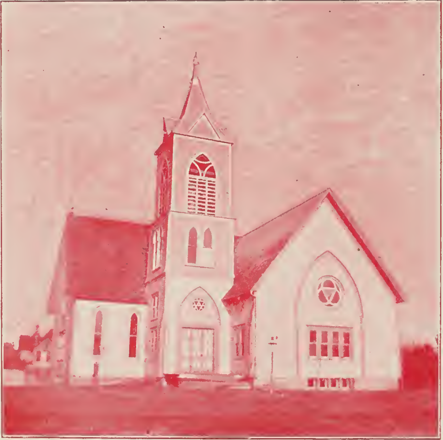
Methodist Episcopal Church, Belleville, Kansas.